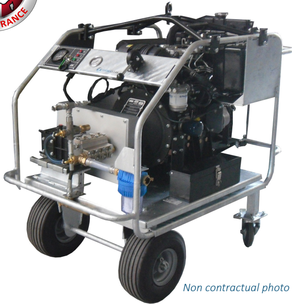
Non contractual photo - 0922